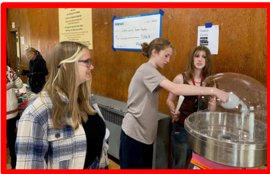
Marshfield Z Clubbers helping with the Foster Family Christmas party. They are setting up the cotton candy machine.