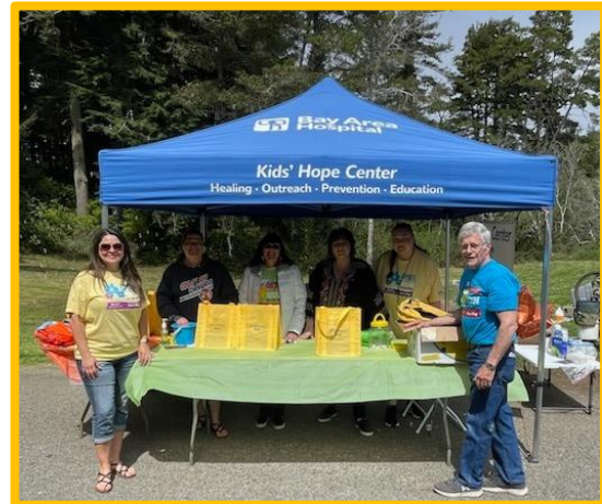
Pictured: Coastal Families Relief Nursery team at the nursery during a recent funder visit, Kids HOPE Center team at Family Fun Day