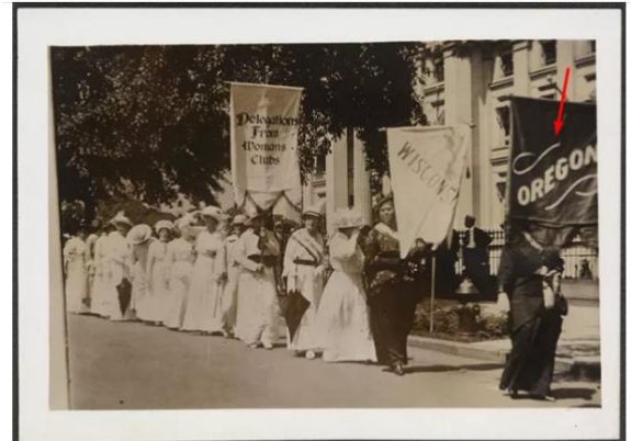
Women, including those representing the states of Wisconsin and Oregon, and delegations from Women's clubs, assemble in first national suffrage parade (1913), Washington, D.C.