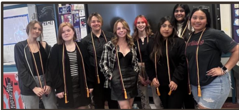
The MHS Z Club graduating seniors wearing the mahogany and gold cords they earned to wear with their graduation robes.

The club has also provided volunteers during the year for various community activities and projects - Suicide Awareness Walk, Oktoberfest, Egyptian Christmas Concert, Foster Families Christmas Party, bellringing with the Zonta Club for the Salvation Army, providing childcare services during a full day training for foster parents, and Family Fun Day. The Z Club had a booth at the Read Across America event at the Coos Bay Library. Their most recent activity was a silent auction and bake sale fundraiser to support the Every Child and Foster Love programs; their net was approximately $1,200. Finally, the Z Club voted to send $500 to Zonta International's Foundation for Women. Money, they earned selling nachos, popcorn, etc. at concessions for school games and events.