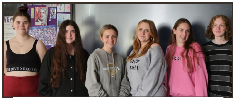
The newly elected MHS Z Club officers for the 2023-2024 school year.

The club has also provided volunteers during the year for various community activities and projects - Suicide Awareness Walk, Oktoberfest, Egyptian Christmas Concert, Foster Families Christmas Party, bellringing with the Zonta Club for the Salvation Army, providing childcare services during a full day training for foster parents, and Family Fun Day. The Z Club had a booth at the Read Across America event at the Coos Bay Library. Their most recent activity was a silent auction and bake sale fundraiser to support the Every Child and Foster Love programs; their net was approximately $1,200. Finally, the Z Club voted to send $500 to Zonta International's Foundation for Women. Money, they earned selling nachos, popcorn, etc. at concessions for school games and events.