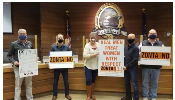
Coos Bay City Council