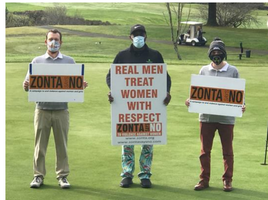
Coos Golf Club

Zonta is an international service organization of women and men working together to advance the status of women at the global and local level through service and advocacy. Currently the Zonta Club of the Coos Bay Area meets via Zoom at noon on the first and third Friday of the month. For more information or to donate to Zonta visit our new website www.zontacoosbayarea.org .