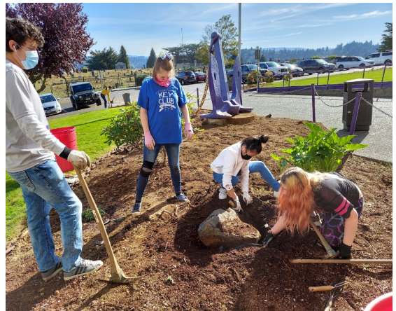
First picture: Working in yard at Marshfield Second picture: Dragging bag of ivy pulled at Mingus

They are partnering with the Key Club to clean up the lawn and plantings area in front of the school and to repaint the anchor and chain "statue." Saturday November 7, Zclubbers will help with stringing Christmas lights at the Railroad Museum.