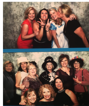
CELEBRITY DINNER 2016