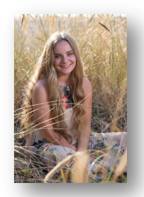
Z CLUB SCHOLARSHIPS $1,500 EACH