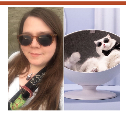
TWO COOL KATS!